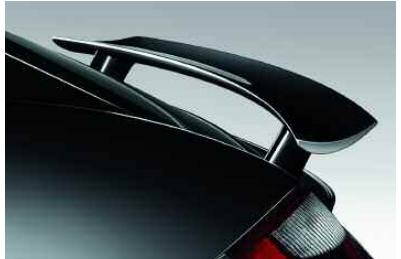
Optimised components: Nose area and new free standing rear spoiler