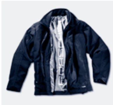
Stylish protection: Windproof jacket • WAP 510 00S-XXL 15

An ideal complement to this jacket is the sporty black fleece, made using a combination of different materials. Its features include two zipped pockets and unobtrusive metal Porsche lettering.