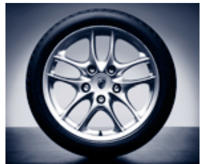
17-inch Boxster S II complete winter wheel set

The dynamic sporty design of the 17-inch Boxster S II wheel is extremely impressive, and not only on the Boxster S.