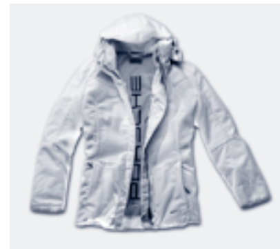
Totally white: Breathable ladies GORE-TEX® jacket • WAP 511 00S-OXL 15

The waisted cut can also be found on the matching sporty fleece with two zipped pockets. The unobtrusive metal Porsche lettering blends in perfectly with the dark green colour.