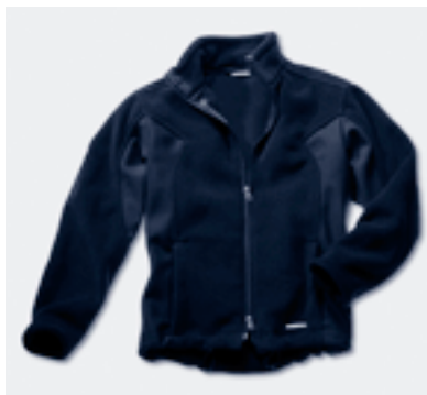
Sporty complement: Black men's fleece • WAP 520 00S-XXL 15