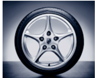
18-inch Carrera complete winter wheel set

The filigree 18-inch Carrera alloy wheel is designed to utilise the full potential of Porsche brakes. Despite its mono-block construction, it is only slightly heavier than a hollow spoked wheel.