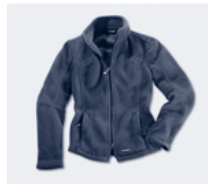
Waisted cut: Fitted ladies fleece • WAP 521 00S-OXL 15

Further information about our full Porsche Design Driver's Selection product range and the current catalogue are available from your local Porsche partner or on the Internet at www.porsche.com