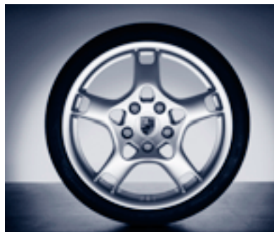
19-inch Carrera S complete winter wheel set

The design of the 19-inch Carrera S wheel is based on a combination of simple geometrical shapes. The result is a totally new, extremely technically-shaped design.