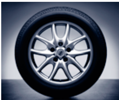
19-inch Cayenne Design Complete winter wheel set

One of the most recent developments from Porsche Tequipment is the complete winter wheel set with attractive 19-inch Cayenne design . The tyres are approved for speeds of up to 240 km/h.