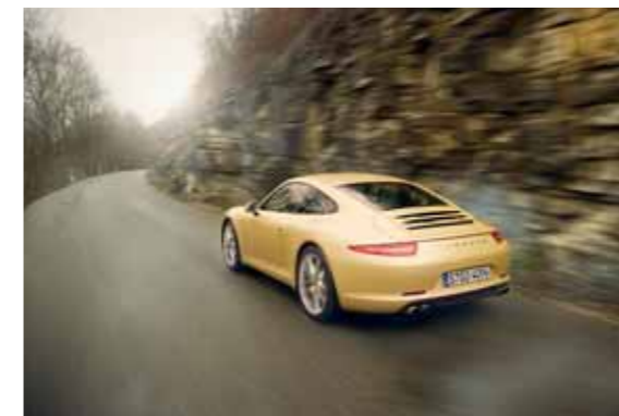
The rear of the 911: Design element and home of a unique drive system

It is the art of being able to take this car from the 1960s and advance it in technical terms without changing its character. It is the art not of denying the march of technology, the ever-more rapid leaps in development, and progression as such, but rather of subordinating them to the 911 principle. Technical progress is used as an in-