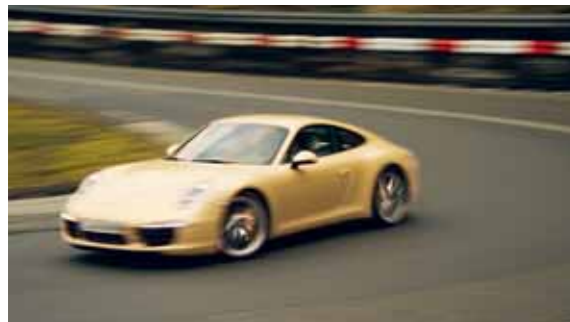
The 911 in its element: Fifty years of the high art of taking curves