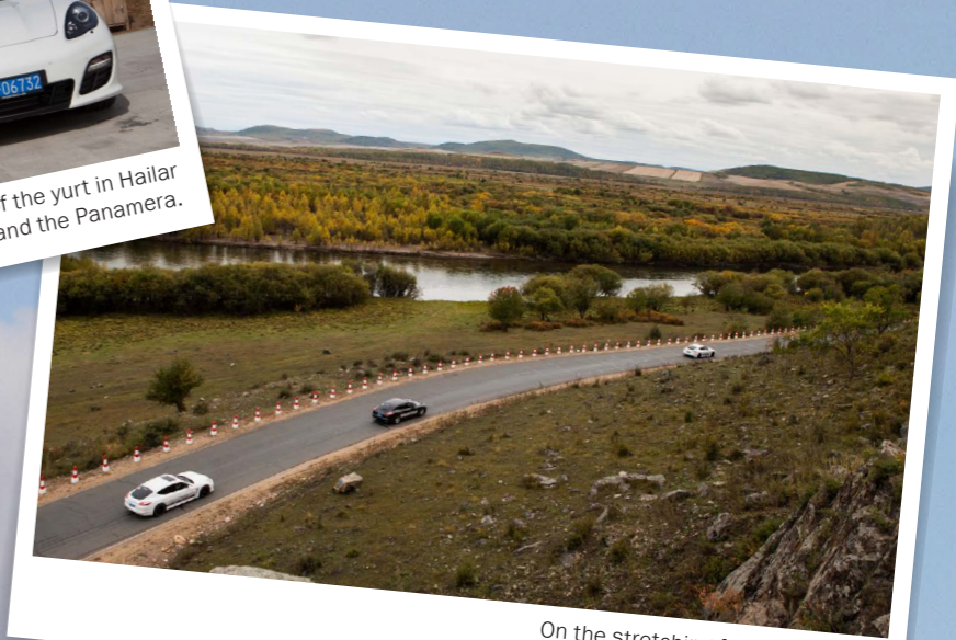
On the stretching freeway through the Genhe Wetland lake.