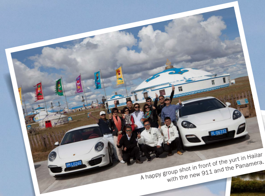
A happy group shot in front of the yurt in Hailar with the new 911 and the Panamera.