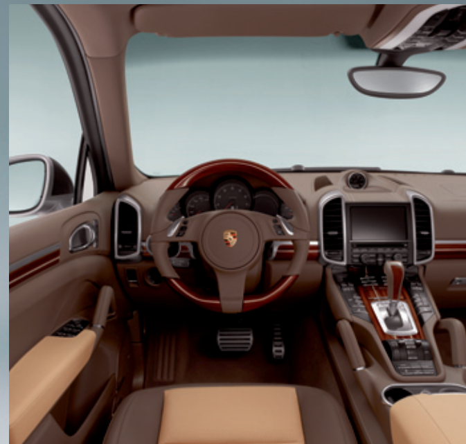
Generously equipped interior

The paintwork on the powerful muscular shape of the mid-size SUV is subtle yet remarkable. A range of striking metallic exterior colours such as Jet Black, Dark Blue, and Amethyst are available and in a stunning contrast, the twin front air intake grills, the lower part of the exterior rear