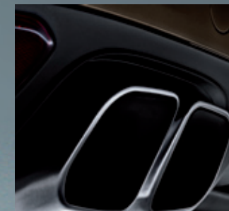
Polished aluminium twin sports tailpipes

As well as comfort and style, a well-equipped interior is the hallmark of the Porsche Exclusive range available for the Cayenne. Its multi-functioning heated steering wheel, superior PCM (Porsche Communication Management) 3.1 navigation unit, and an unrivalled