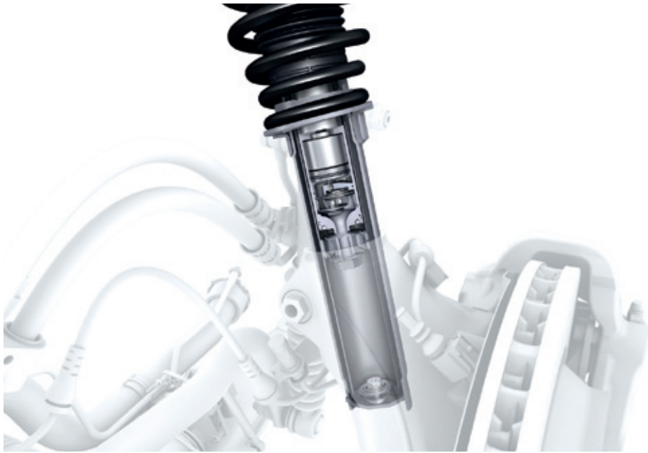
Porsche Active Suspension System