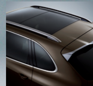
The real spoiler edge, the roof rack and window edges painted in Silver Metallic

BOSE® surround sound system all attest to the Porsche philosophy rooted in the continuous technical innovation as well as constant devotion to comfort, style and performance. Headrests embossed with the Porsche crest are the subtle final touches that set the Cayenne apart.