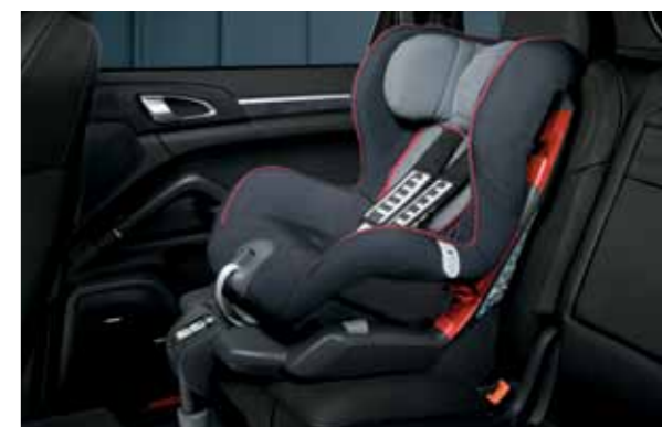
Model: Porsche Junior Seat ISOFIX, G 1 Weight: 9 to 18 kg. Age: approx. 9 months to 4 years old