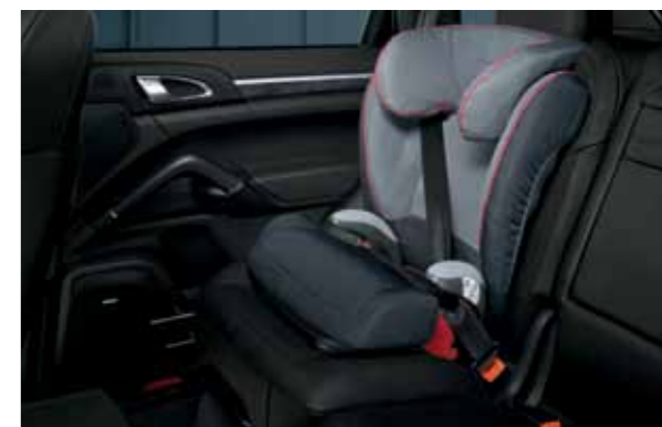
Model: Porsche Junior Plus Seat, G 2 + G 3 Weight: 15 to 36 kg. Age: approx. 3 1/2 to 12 years old