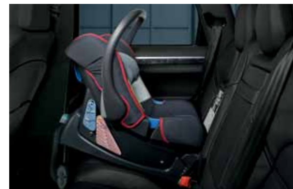
Model: Porsche Baby Seat ISOFIX, G 0+ Weight: up to 13 kg. Age: up to approx. 18 months

Driver safety has always been a priority at Porsche. Now with the Porsche child seats, everyone in the family can enjoy a comfortable and safe drive with Porsche.