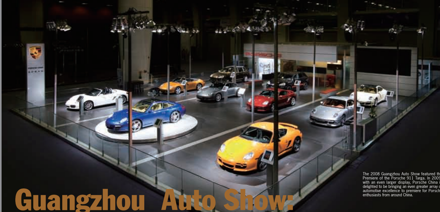
The 2008 Guangzhou Auto Show featured the Premiere of the Porsche 911 Targa. In 2009, with an even larger display, Porsche China is delighted to be bringing an even greater array of automotive excellence to premiere for Porsche enthusiasts from around China.