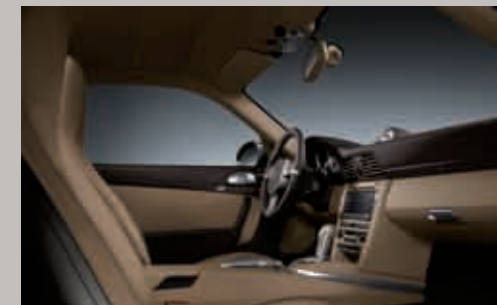
▲ Individual leather in Hazelnut Brown combined with leather in Cocoa