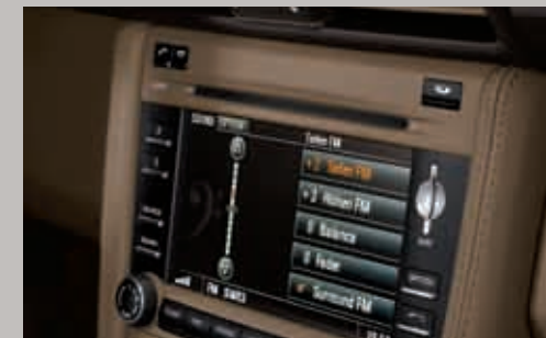
▲ PCM package in Hazelnut Brown leather

911 Turbo: The epitome of sportiness. Now Porsche Exclusive's new Aerokit Turbo offers you the option of enhancing the powerful lines of your 911 Turbo. Aerodynamically optimised in the Porsche wind tunnel, the package components include distinctive front spoiler lip and rear lid with rear spoiler and fixed wing profile. The Aerokit Turbo reduces the lift forces on front and rear axle, improving driving stability and perfecting the stylish sportiness of your vehicle.