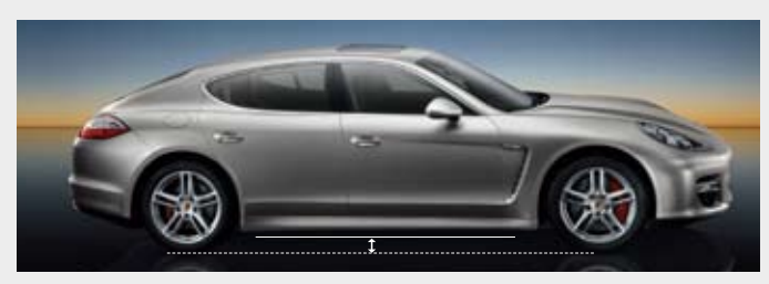
▲ Normal level – Max. ground clearance 144 mm as per DIN unladen weight. The system's default setting.