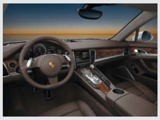
Interior of Panamera Turbo in natural leather in shade Espresso. Walnut Burl

The Porsche Car Configurator at www.porsche.com enables you to test your personalisation preferences – exterior and interior – in advance. Design your own Panamera and explore your individuality – in the fourth dimension.