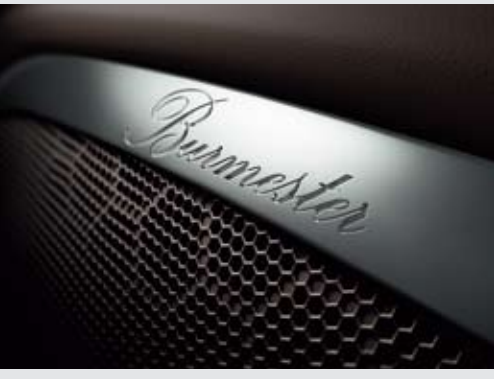
▲ Burmester® High-End Surround Sound System

For more information on the new Porsche dimension, visit the Panamera Web Special at: http://www.porsche.com/microsite/panamera/china-en.aspx