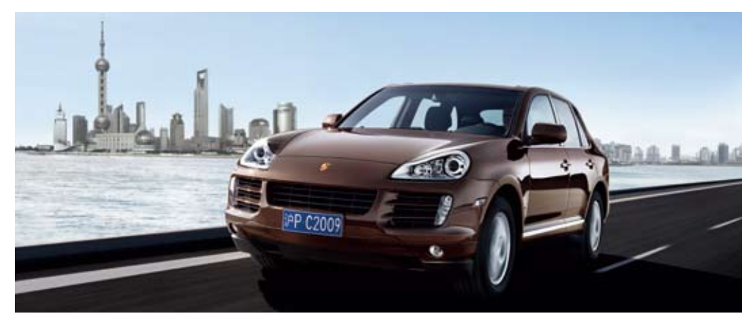
▲ The Porsche Cayenne Edition Style was the first car launched exclusively for Porsche enthusiasts in China.

The success of this model exclusively available in Mainland China, was yet another example of the Porsche China continuing to grow from strength to strength.