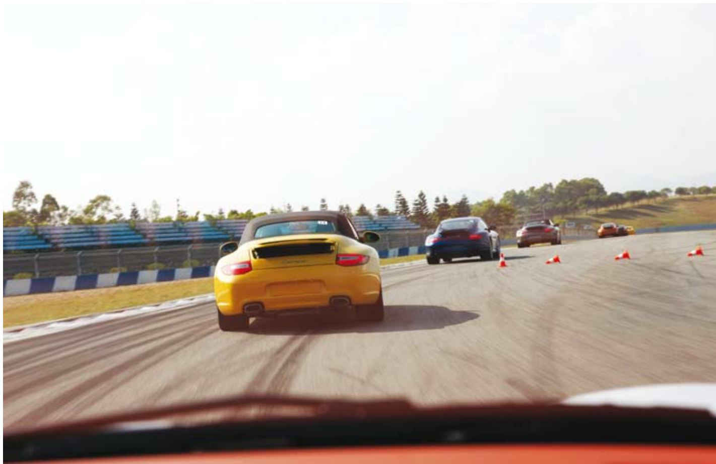
A rewarding experience on the track