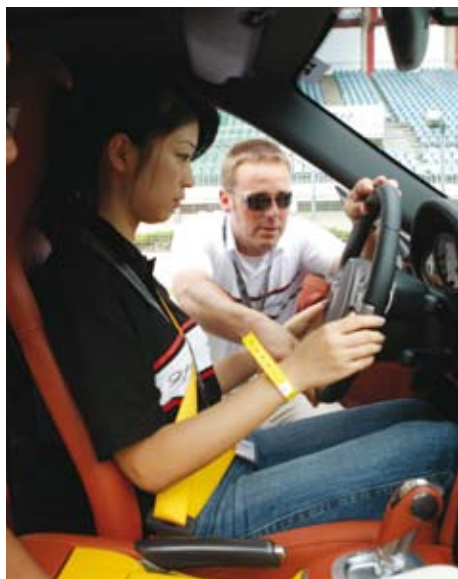
Guided tips from a Porsche instructor

accelerate to 70 km/h, before swerving suddenly from one side of the track to the other with minimal margin for error. The aim was to simulate an unpredicted lane change, thus showing how stable yet agile the new 911 is, even at higher speeds.