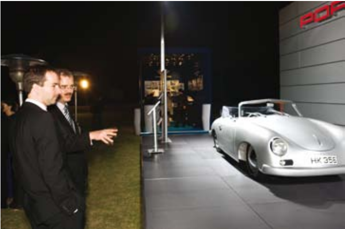
The Porsche hospitality area, where guests admired the Porsche 356 A Cabriolet, the new Porsche 911 Carrera S and Cayenne Turbo S (top and bottom)

The Hurun Report anniversary celebration was without doubt a fantastic occasion for Porsche, and by the time guests settled down to their gourmet dinner on that cool autumnal evening, you could not help but marvel at the combined accomplishments of everyone present, assured once again that the future of China remains in good hands. ◀