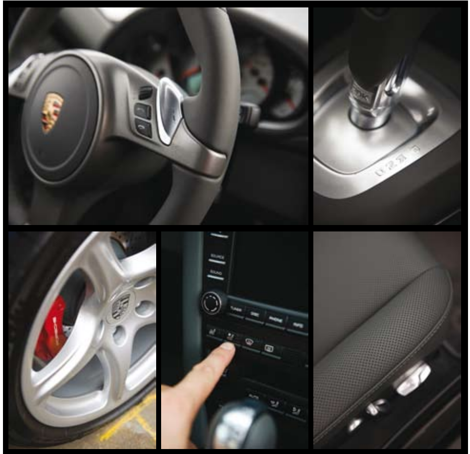
A close up of the 911's features, including the Porsche Doppelkupplung (PDK), steering wheel (top left) and gear shifter (top right)

With excitement levels at an all time high, the participants moved on to the second exercise, the Moose Test, where they would